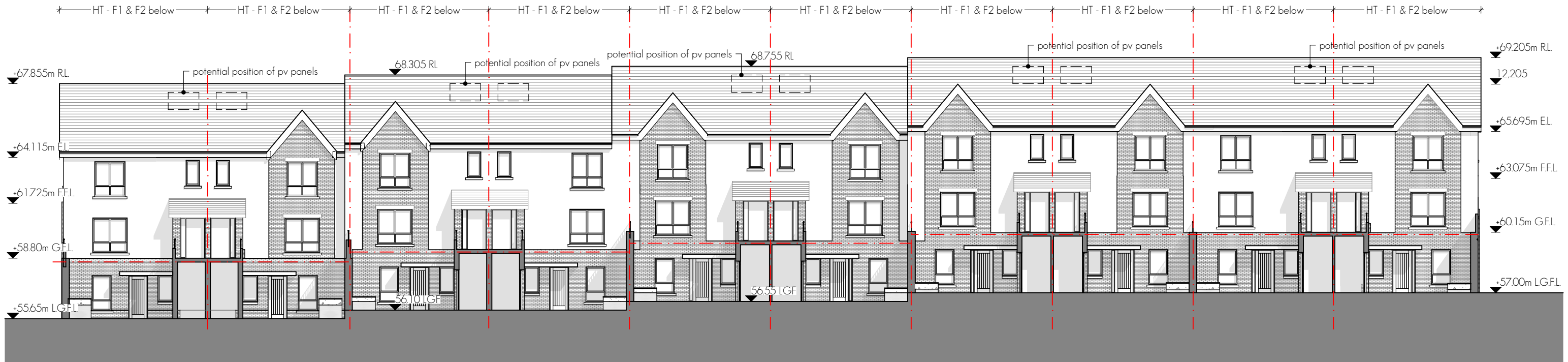
CONTEXTUAL FRONT ELEVATION (NORTH EAST) - SHOWING LOWER LEVEL 1:200